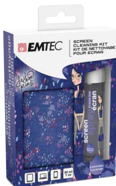
Blue Snow Lavender