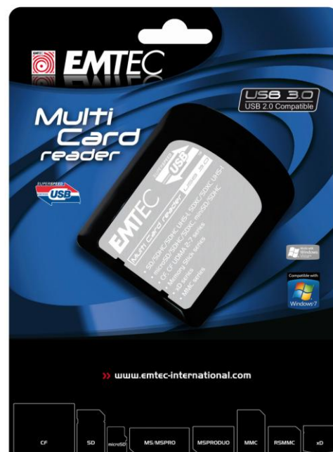
The Multi Card reader in its blue packaging